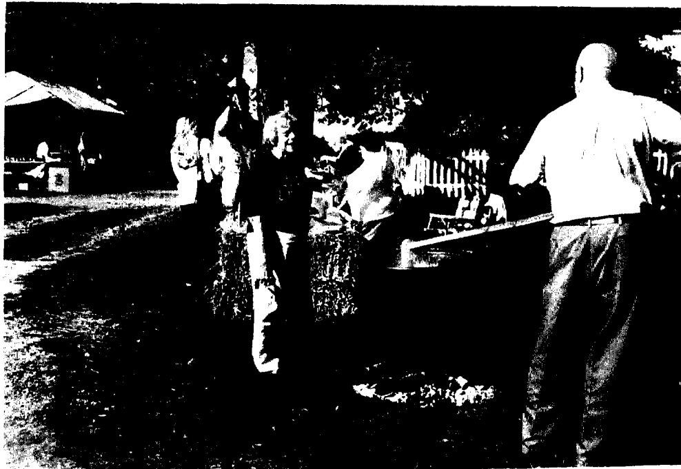
Bean Soup cooking in Kettle over open fire Table with Sandwiches and Cider behind Kettle Bake Sale under Canopy in the Background