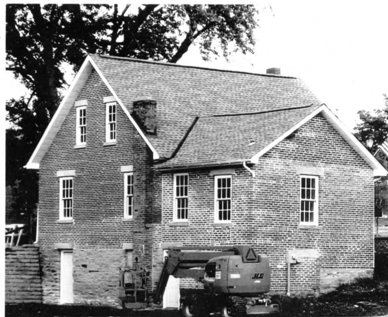
South and west sides of the newly restored Phelps House in the center of New Albany, Ohio

www.newalbanyplaintownshiphistoricalsociety.org