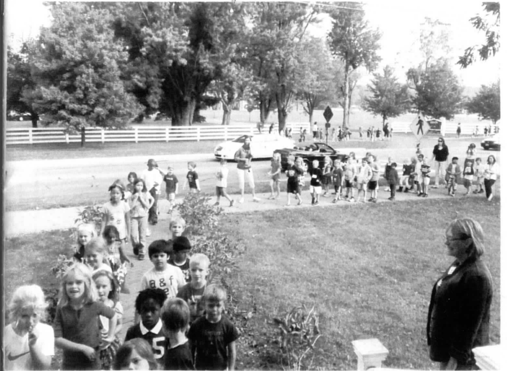
Two classes of first-graders arriving at the Ealy House for tours while two other classes are returning to their school, October 2013. (See page 3 for more details.)

November and December 2013 New Albany-Plain Township Historical Society