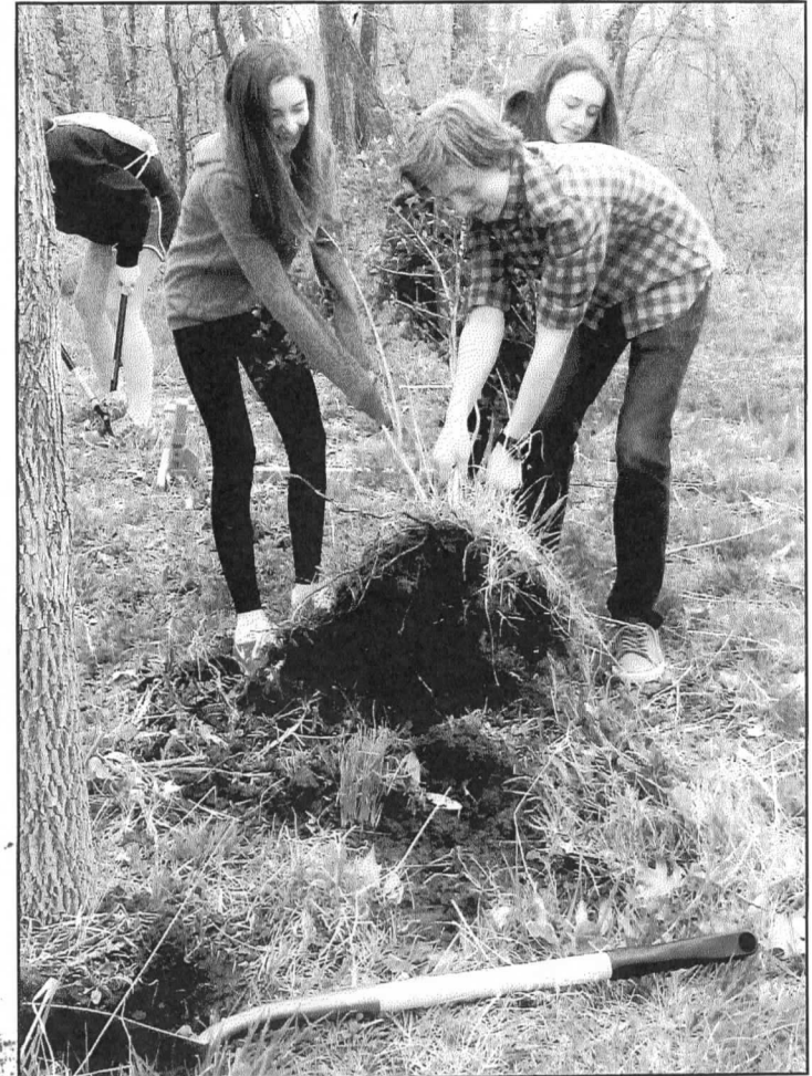
Students removing invasive Honeysuckle Shrubs in woodland just east of the Ealy House

September & October 2014 New Albany-Plain Township Historical Society