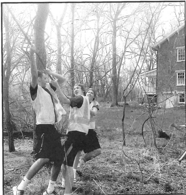
Students removing wild Grapevines that strangle native Ohio trees. The Ealy House is to the right.

NOTE: The 6-acre Resch Park is included with the Ealy House in the National Register of Historic Places.