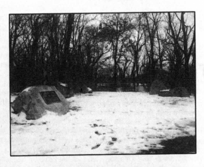
Entrance to Resch Park The amphitheater is farther ahead, down toward the creek.