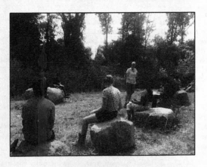
Students seated on the boulders in the amphitheater.