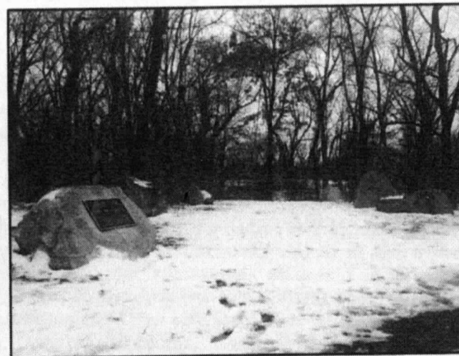
Entrance to Resch Park The amphitheater is farther ahead, down toward the creek.