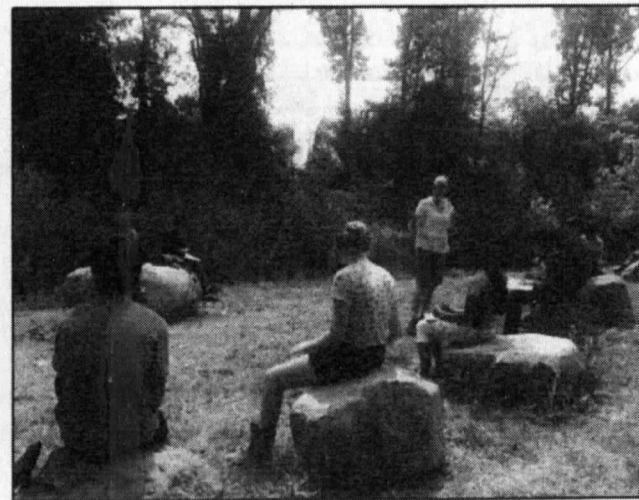
Students seated on the boulders in the amphitheater.