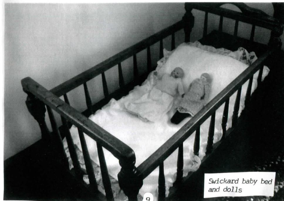
Swickard baby bed and dolls