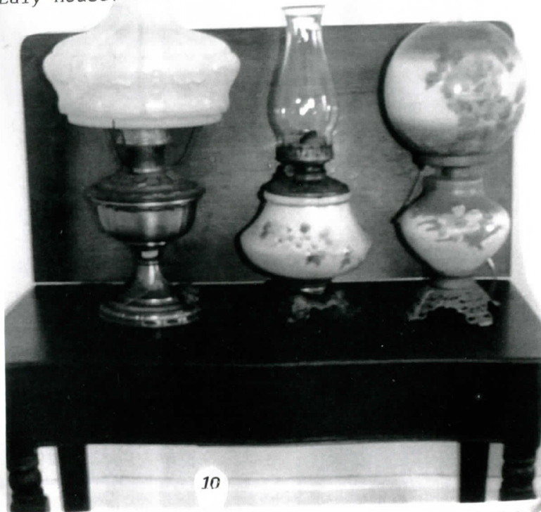
Swickard antique card table and oil lamps

Of course, our Society will also display various historic items in the Elementary School gym, including the Heritage Quilt, large old maps, vintage scrapbooks, photographs, and more. We are requesting more ideas and suggestions from our members. Closer to the time of the festival, we will be soliciting help at both the gym and the Ealy House.