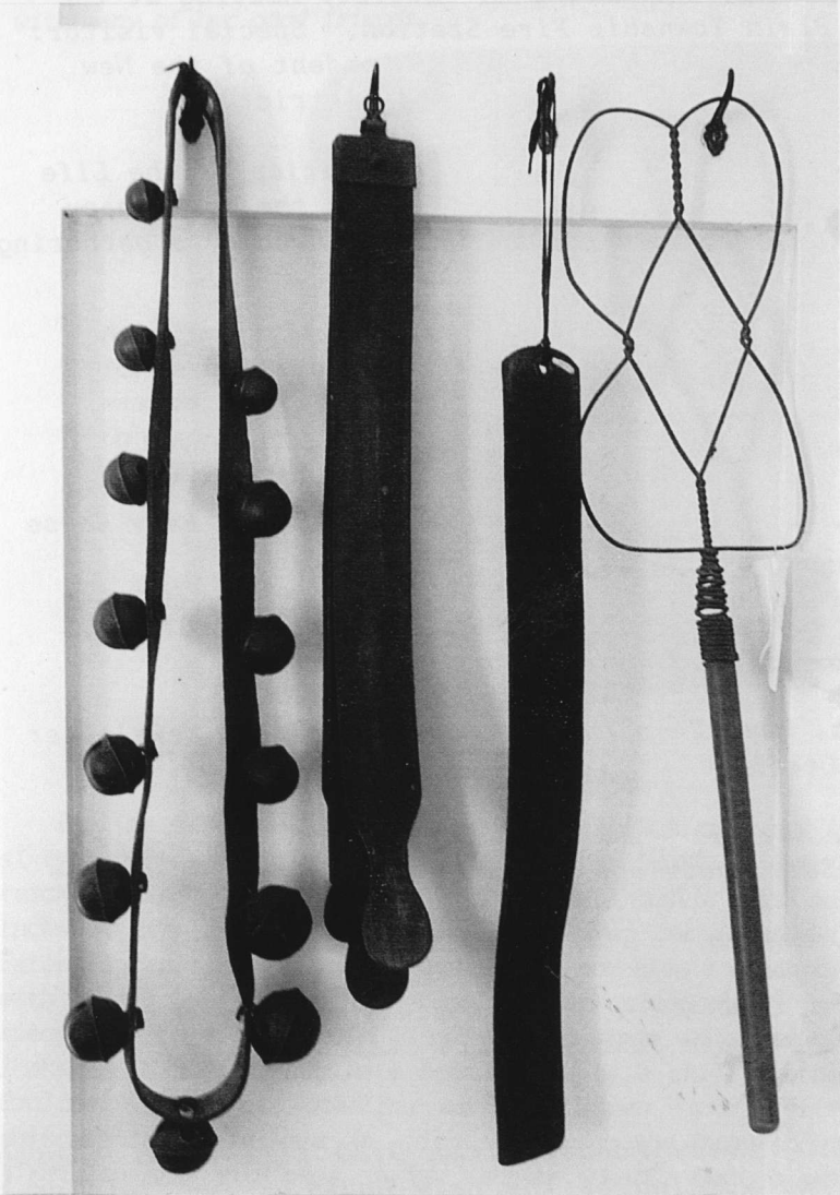
Old Plain Township sleigh bells, leather razor strops, and a carpet-beater, all on display in the Ealy House

New Albany-Plain Township Historical Society