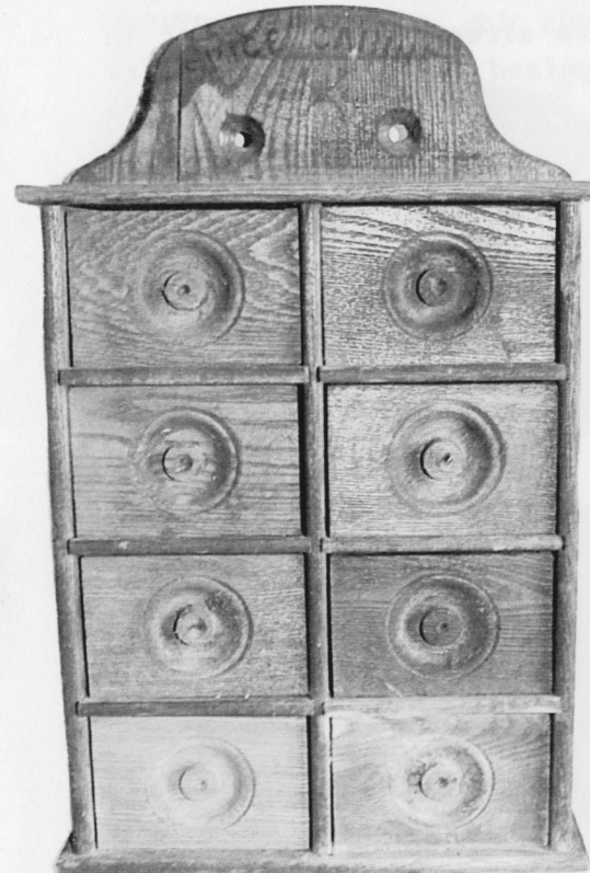
Antique Spice Cabinet at the Ealy House