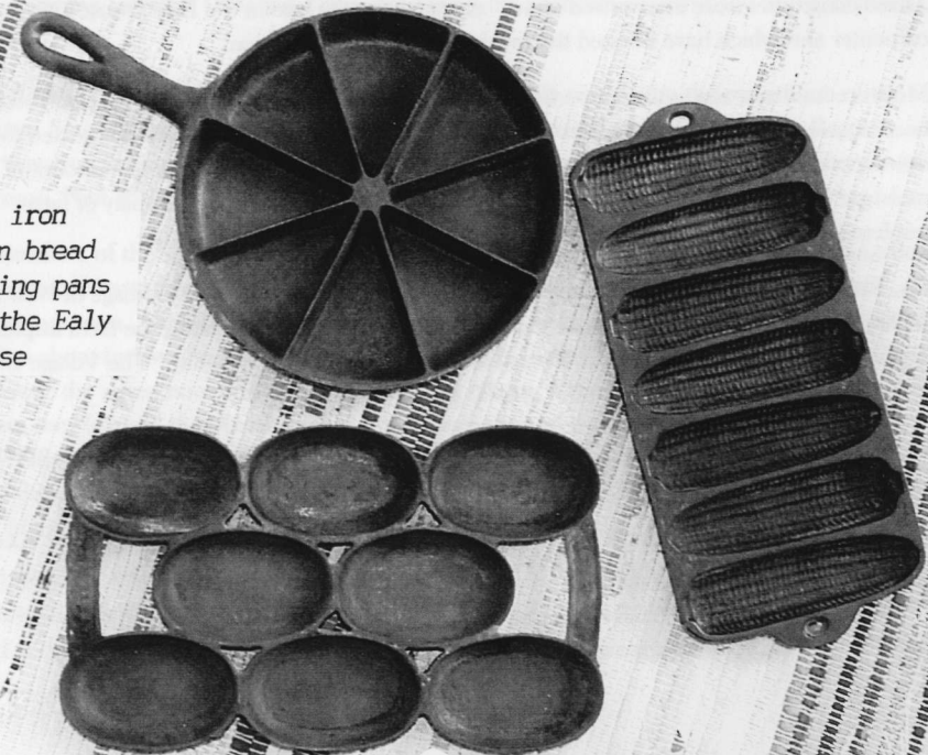
Old iron corn bread baking pans at the Ealy House