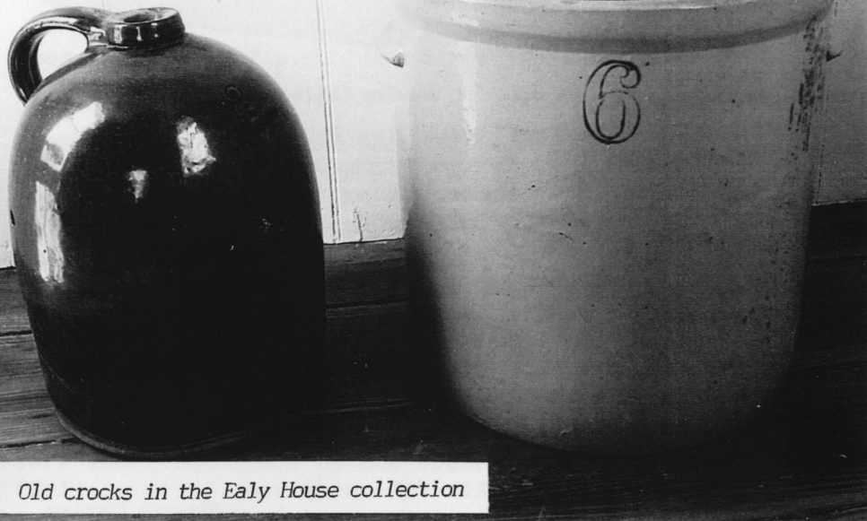
Old crocks in the Ealy House collection