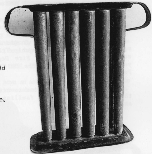
An antique mold for making 12 candles. On display in the Ealy House.