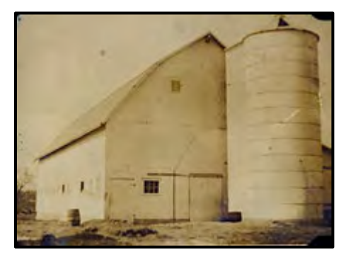
Beautiful 1920s image of Taylor Barn that was torn down in 2023